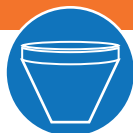
CONICAL POLYESTER FILTER