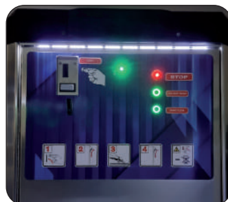
LED lighting kit (on request)