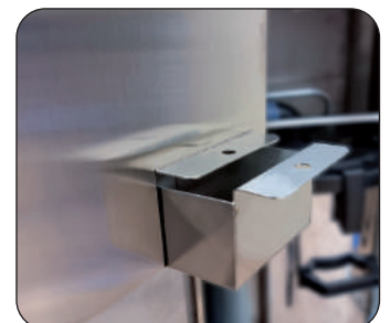
Lockable coin box (standard)