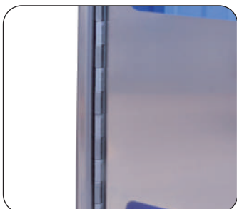
Full-length stainless steel door hinge (standard)