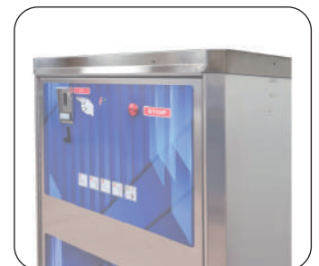
Stainless steel cover (on request)