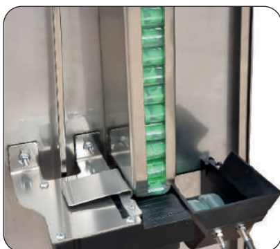
Tire valve caps dispenser (on request)