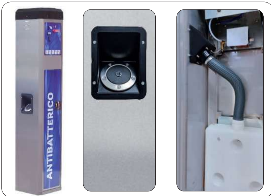
Side-loading cap (on request!)