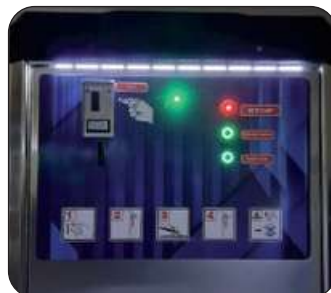
LED lighting kit (on request)