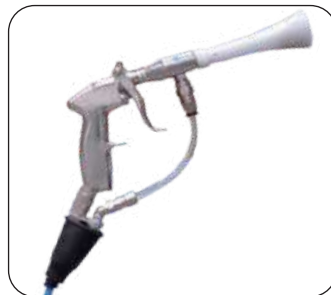
Cyclonic gun (standard)