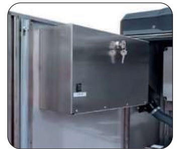
Lockable coin box (standard)