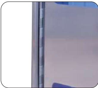
Full-length stainless steel door hinge (standard)