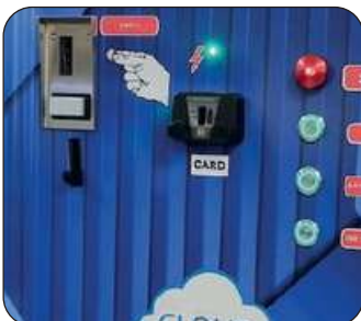
Card reader cashless (on request)