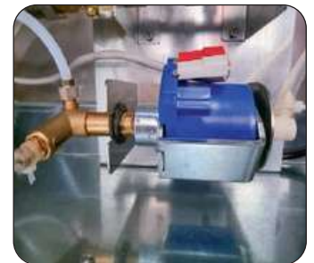
Electromagnetic pump (standard)