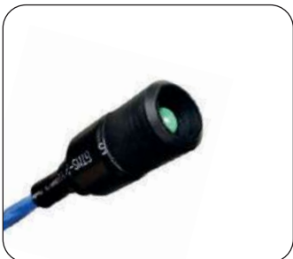
dispensing nozzle (standard)