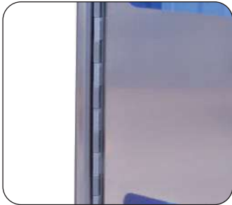
Full-length stainless steel door hinge (standard)