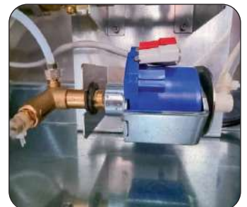
Electromagnetic pump (standard)