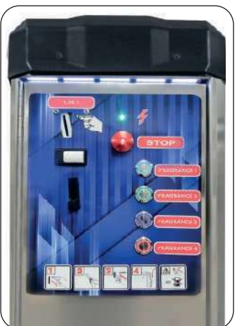
Back-lit LED steel buttons (standard) LED lighting kit (on request)