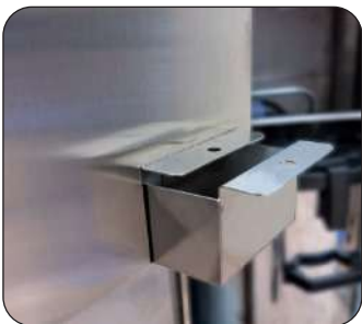
Lockable coin box (standard)