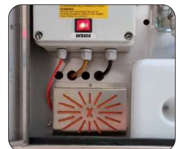
Antifreeze kit (on request)